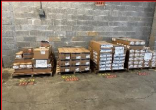
Storage, Staging, & Kitting