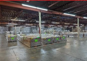
Bonded Insured Facilities

Count on Womack Electric Supply's Project Materials Management Solutions.